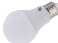
Maintenance Warehouse® 15W A19 LED A-Line Bulb, 2,700 Kelvin 701813