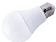
Maintenance Warehouse® 9W A19 LED A-Line Bulb 701144