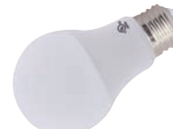
Maintenance Warehouse® 9W A19 LED A-Line Bulb, 4,100 Kelvin 701814