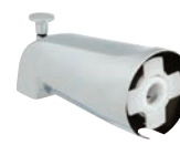
Seasons® Chrome Diverter Tub Spout 425170 ⚠ See Footnote

⚠ WARNING: California Residents, this product contains chemical(s), which is/are known to the State of California to cause cancer and/or birth defects or other reproductive harm. Find more information by visiting hdsupplysolutions.com to review the specific product details.