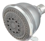
Seasons® Showerhead 307131