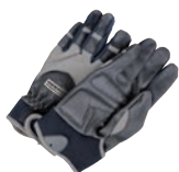
Maintenance Warehouse® High-Dexterity Gloves 282529