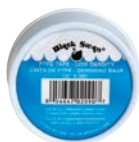
Black Swan® PTFE Tape 401605