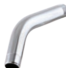
Shower Arm - Chrome 529435