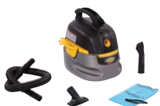
RIDGID® Stinger™ Wet/Dry Vacuum 181763