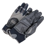
Maintenance Warehouse® High-Dexterity Gloves 282529