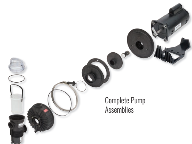
Complete Pump Assemblies