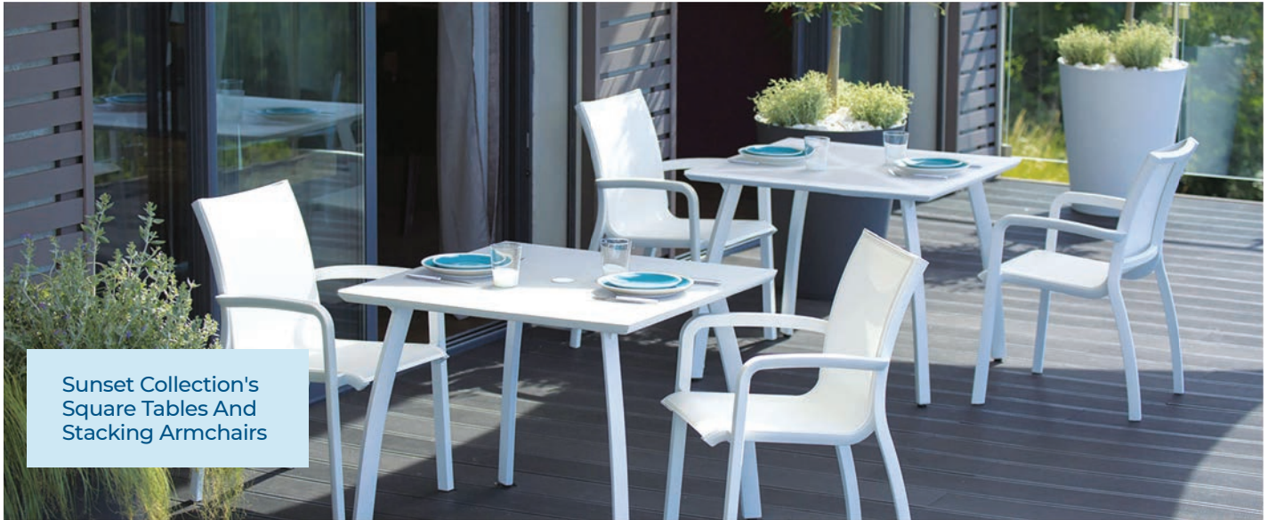
Sunset Collection's Square Tables And Stacking Armchairs